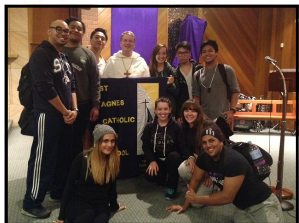
Students and teachers 'Chillin' with the Bishop after the Good Friday Walk.